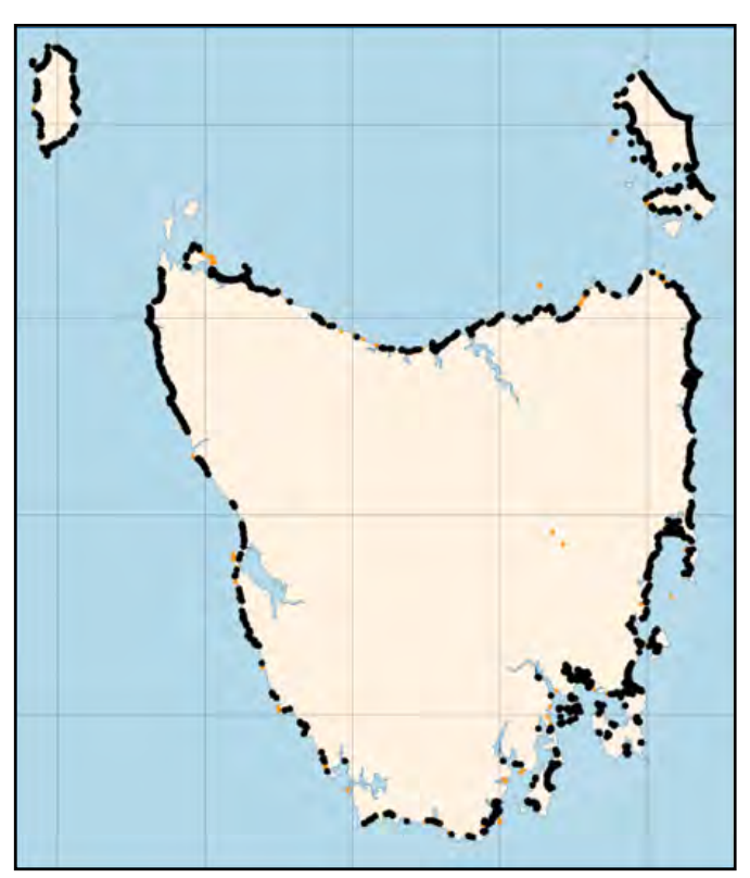
Figure 22: Map showing the distribution of Pied Oystercatcher, Haematopus longirostris, in Tasmania, 1992–93 to 2020–21 (black symbols), n = 3600 records as of December 2020. Grid shows 1° x 1° latitude and longitude. Orange symbols indicate surveys where no Pied Oystercatchers were observed.

their global populations. The analyses reinforce the speculations of Newman (1982) of the importance of Tasmania for Eastern Hooded Plovers almost 40 years ago. Many threats are common to both species (Bryant 2002, Spruzen et al. 2006, Maguire et al. in press), with the spectrum of threats increasing in frequency and intensity (Woehler in press). With mainland populations of Hooded Plover decreasing more rapidly than those in Tasmania (Maguire et al. in press, E.J. Woehler unpubl. data), there can be no doubt that Tasmania is already the refugium for both taxa. As the mainland populations for both taxa decrease, so the proportion of the populations in Tasmania will increase, further reinforcing Tasmania's critical role in the conservation of both taxa.