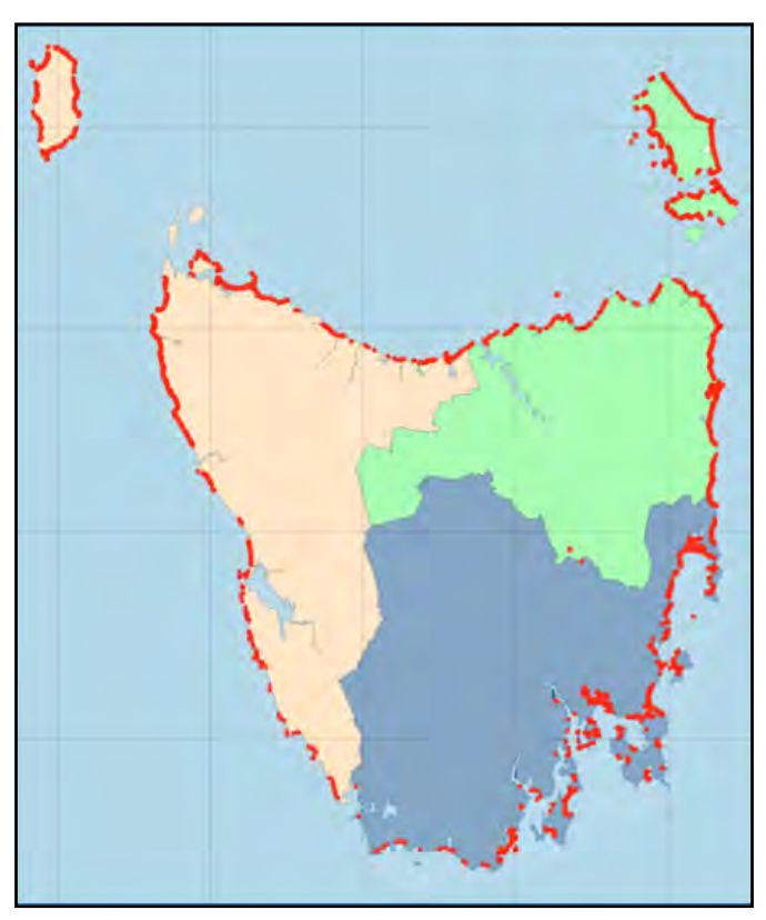
Figure 20: Map showing survey effort for 1992–93 to 2020–21 (red symbols) for resident shorebirds in Tasmania and adjacent islands; n = 8100 records on more than 450 beaches as of December 2020. The three NRM regions are shown: Cradle Coast (orange), North (green) and South (blue). The arid shows 1° x 1° latitude and longitude.

Newman and Patterson (1984) estimated the Tasmanian Hooded Plover population to be 1730 birds, based on extrapolation of density data calculated from 'potentially suitable beaches' around Tasmania. This was the first quantitative estimate for the species in Tasmania,